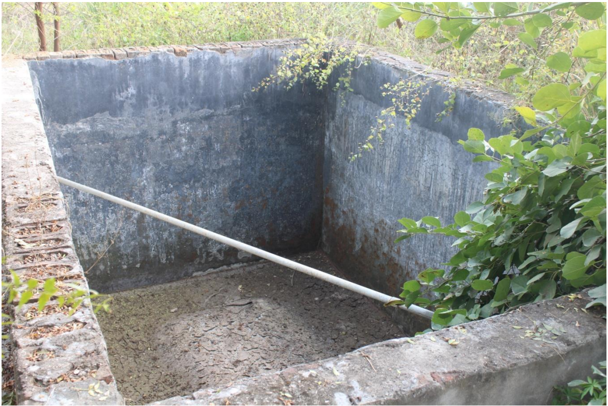
28KM Mile Stone, Agra-Delhi Highway, NH-2, Farah, Mathura - 281122