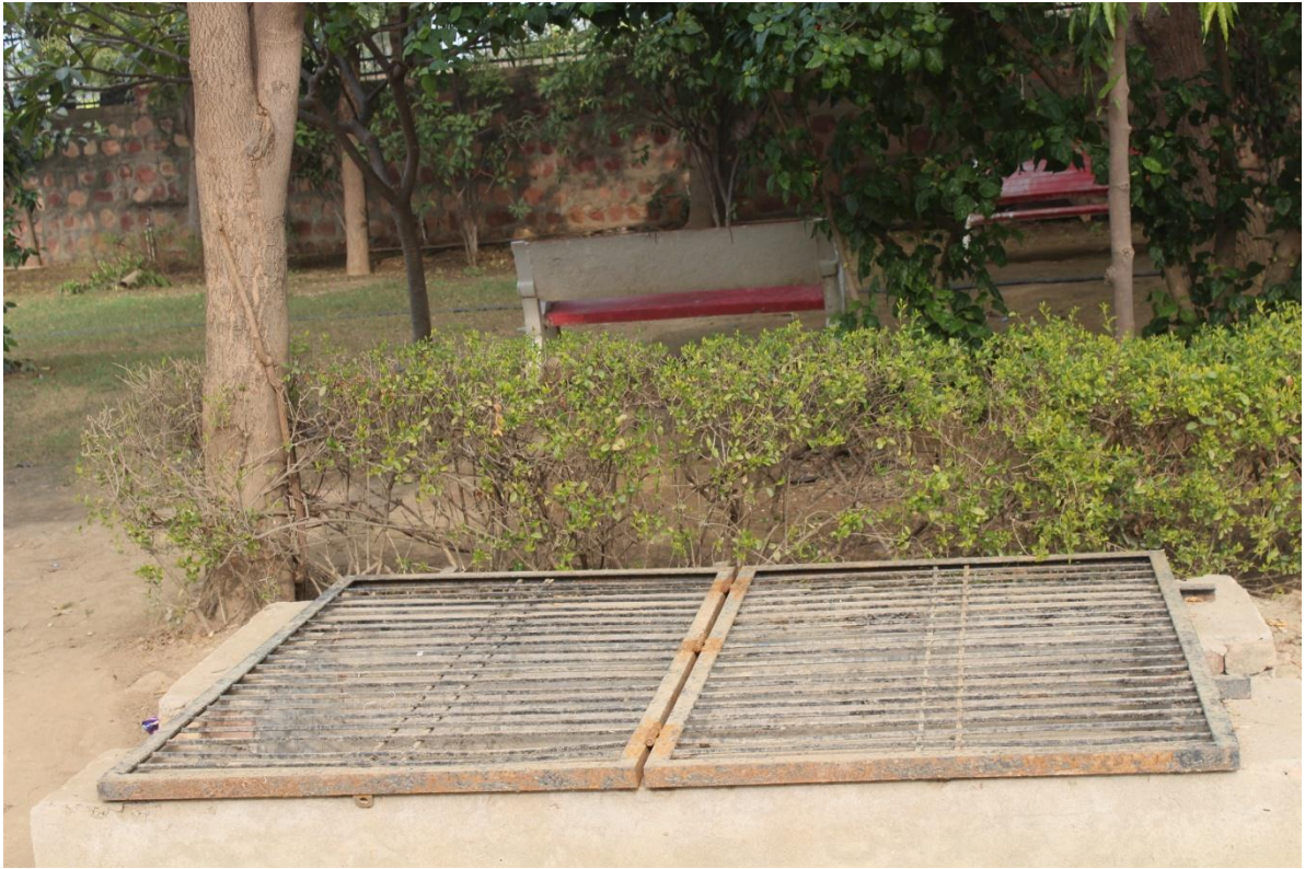
28KM Mile Stone, Agra-Delhi Highway, NH-2, Farah, Mathura - 281122